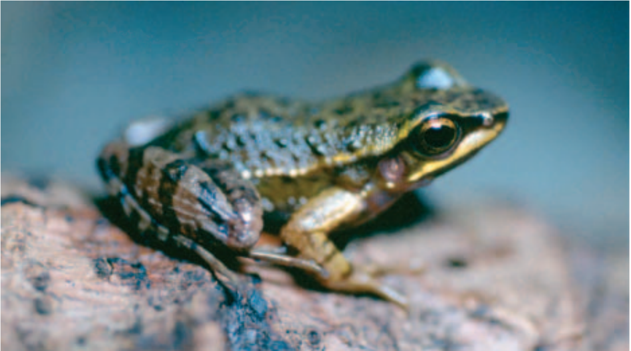
Figure 1. Adult male of Hylodes magalhaesi . Municipality of Camanducaia, State of Minas Gerais, Brazil. DOI: 10.1514/journal.arc.0040017g001

January 2002). A collecting permit was provided by Instituto Brasileiro do Meio Ambiente e dos Recursos Naturais Renováveis (IBAMA 02001.002792/98-03).